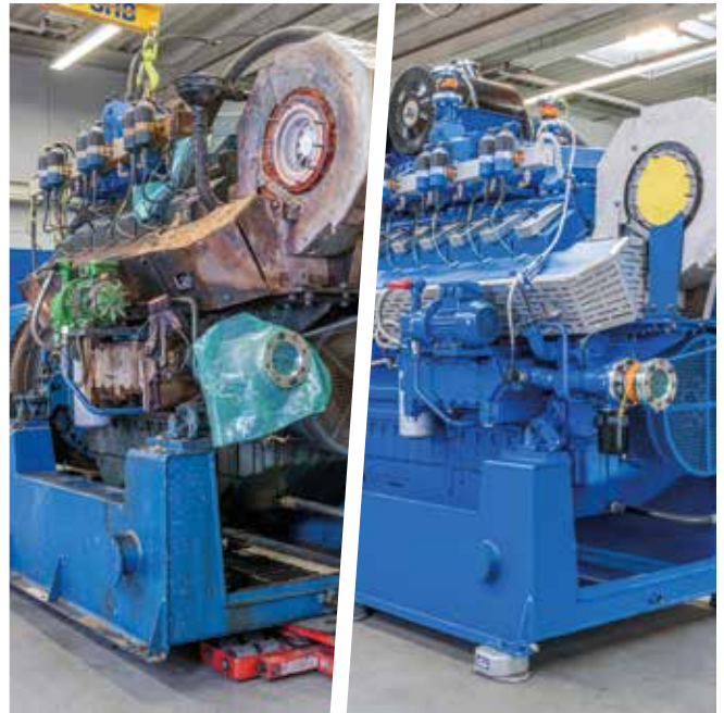
After 3-4 days, the MWM X-Change genset is ready to use (technically up to date and newly painted)