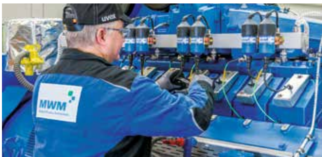
Quality control prior to delivery

Only genuine MWM new and X-Change spare parts and manufacturer rebuild components are used for the overhaul. Additionally, the entire engine wiring is replaced.