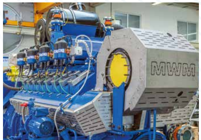
Refurbished X-Change genset