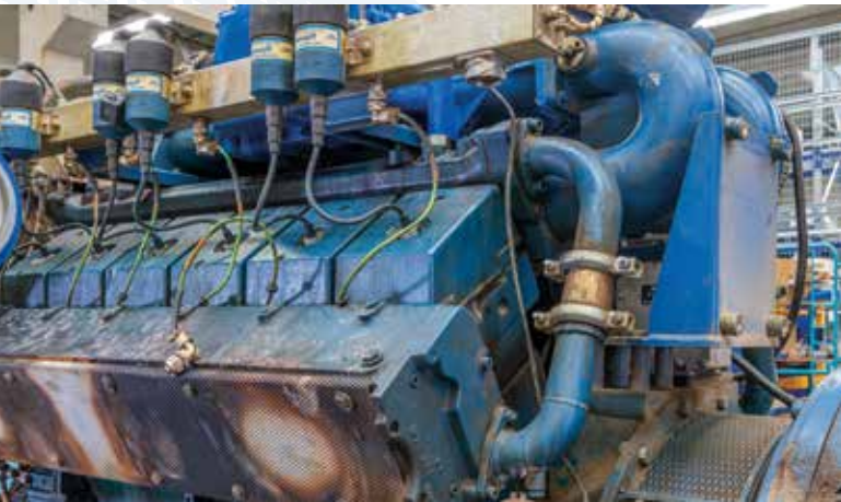
Prior to the repair

The MWM service offers refurbished X-Change gensets for TCG 2016 and TCG 2020 according to the latest manufacturer specifications at attractive fixed prices.