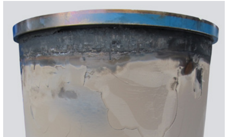
Cylinder liner TCG 2016 after 8000 oh with heavy deposit formation due to an incorrect inhibitor dosage